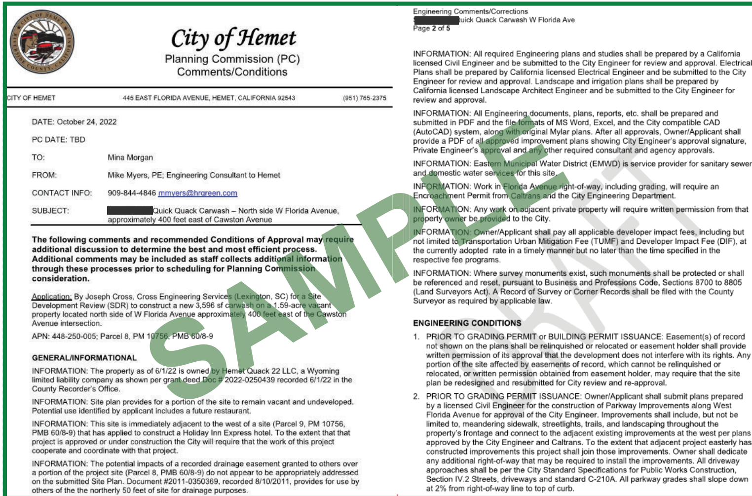
Exhibit showing (partial) comprehensive response to first project review.

Description: As part of our proactive approach initiative, the HR Green team provides a comprehensive project review and recognizes the larger engineering issues that need to be prioritize in order to not disrupt the project review. We coordinate with other departments and agencies (such as Riverside County Flood Control and Water Conservation District and Caltrans) in order to get an understanding of other agencies' requirements and begin the condition of approval and or mitigation of issues as soon as possible.